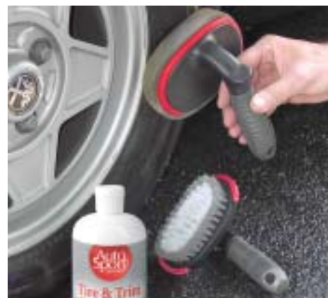
Take an extra five minutes to protect and beautify your tires.

Tire/rubber/vinyl dressings should contain strong UV protectants, but should be free of raw silicone oil and formaldehyde. These latter ingredients will dissolve the oils in rubber and vinyl. Our AutoSport Tire & Trim Protection replenishes these essential oils and, when used regularly, prevents aging and cracking caused by UV rays and environmental pollutants. It dries to a matte, non-oily finish that won't attract dust and debris.