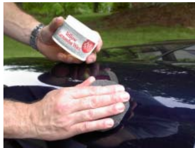
Apply paste wax by hand...

Between major wax jobs, our AutoSport Carnauba Detailing Wax is ideal for cleaning up those water spots, tree sap, and bug and bird residue. Just spritz it on and buff it dry with a cotton towel to restore that brilliant just-waxed shine.