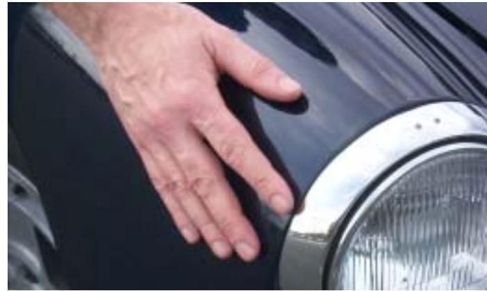
Let your fingers tell you when it's time to clean the surface.

Run your fingers across a horizontal surface of your vehicle. If you feel any sticky residue or sandpaper-like grit, it needs to be fully cleaned before waxing. The cleaning process will remove harmful residue, smooth out fine scratches and remove the oxidation that's dulling the finish. How often you perform this ritual is dependent upon where your vehicle is parked and the environmental conditions to which it is subjected. If you use a garage most of the time, you'll probably need to clean and wax twice per year. If the vehicle is parked outside under harsh conditions (smog, acid rain, etc.) you may need to clean and wax it every two months. In a given environment, a dark car may need to be waxed more often than a lighter one.