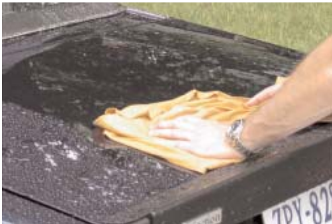
A good chamois takes water off fast.

Begin drying immediately. Remove excess water with a squeegee, chamois or cotton towels. If you prefer a chamois, use it only to remove excess water, and be sure it is English Cod Oil tanned, like our AutoSport Double-Thick Chamois. Other tanning processes use chemicals that can remove wax and scratch the finish. Dampen the chamois or towel slightly, wring it out, and lay it open on the surface. Gently pull the water from the surface in a straight-line motion. Work from top to bottom, and if using towels, change them often. With heavy deposits of water removed, complete the drying process by gently buffing with clean cotton towels. If you're using new towels, wash them first, to remove any "sizing." It's best to wash them in phosphate-free detergent and do not use fabric softeners. Chemicals in fabric softeners can damage automotive finishes.