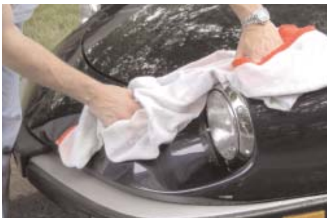
Towel off any last remaining droplets.