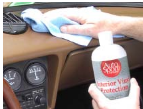
Replenish the essential oils your vinyl needs.

Exposure to UV rays causes vinyl to release the oils that make it flexible. This is particularly noticeable on a vinyl dash. That difficult-to-remove haze that sometimes forms on the inside of your windshield is actually escaping oils that have deposited themselves on the glass. As with exterior vinyl protection, never use formulas containing raw silicone oil or formaldehyde. Those substances will dissolve the essential oils in the vinyl, causing it to crack.