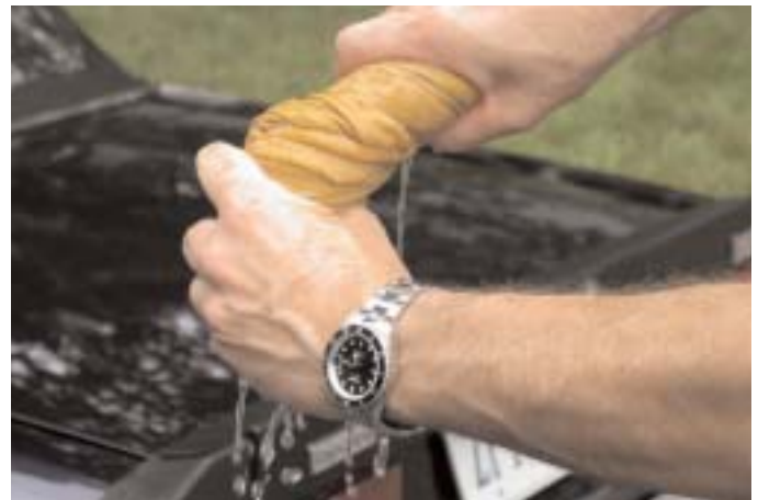
Wring it out, rinsing often in clear water.