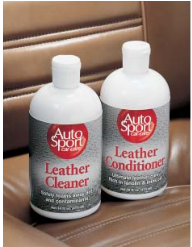
A little leather care keeps seats supple for years.

Proper cleaning should remove contaminants—not grind them into the surface. Use pH-balanced (pH7) leather cleaner, such as our AutoSport Leather Cleaner, to remove dirt and oil without harming the delicate leather surface. Wet a washcloth in a bucket of water and wring it out. Leave it damp, and apply two or three half-dollar sized spots of leather cleaner to the wet cloth. Clean the surface in small sections (about 1 sq. foot), wipe away the cleaner, and towel dry. Rinse the washcloth and repeat this process until you've bathed all leather surfaces. Don't forget to clean the stitching. Ground-in dirt can ruin upholstery thread, so proper cleaning will extend thread life. You can spot-clean leather whenever necessary, but overall cleaning should be done about 2 - 3 times a year.