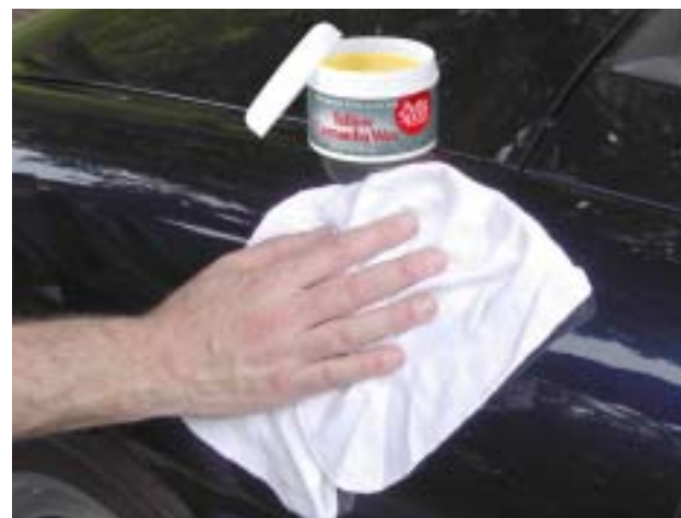
Either way, buffing off is the same.