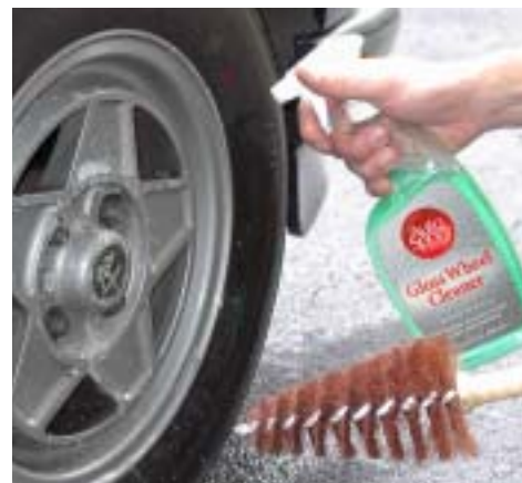
Black brake dust can eat away the finish coat if you let it!

Harmful disk brake dust builds up on wheels, particularly the front ones, and can be removed with a non-caustic wheel cleaner such as our AutoSport Gloss Wheel Cleaner. It easily removes the grime and keeps your wheels looking shiny longer. However, if you've waxed your wheels, it's best to spritz them with our AutoSport Detailing Wax after cleaning, as the repeated application of wheel cleaner will remove the wax coating.