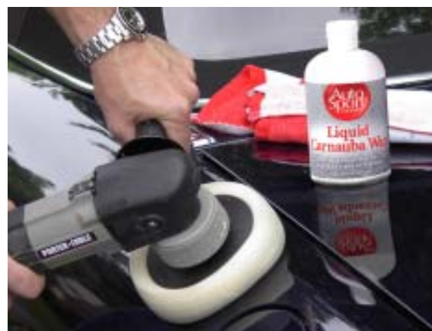
...or liquid, by machine or by hand.