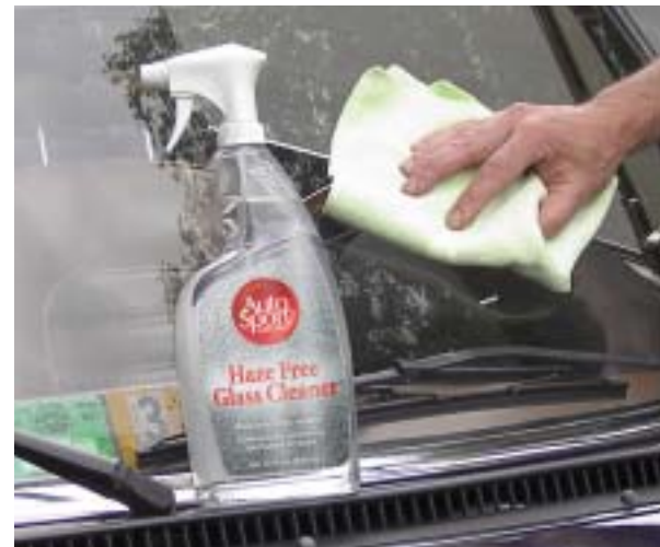
Get rid of bugs on the outside; haze on the inside.

The true test of a glass cleaner is how well it avoids streaking and hazing, and our AutoSport Haze-Free Glass Cleaner is just that: haze free. It dries without streaks and gets those windows squeaky clean. It's also formulated to effectively remove the annoying (and dangerous) filmy residue on the inside of your windshield that seems especially prevalent in newer cars. Just spray and wipe. For best results, use two cotton or microfiber towels: one for cleaning, and the other to dry the glass.